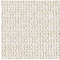
White/Beige 4000 L | SCR