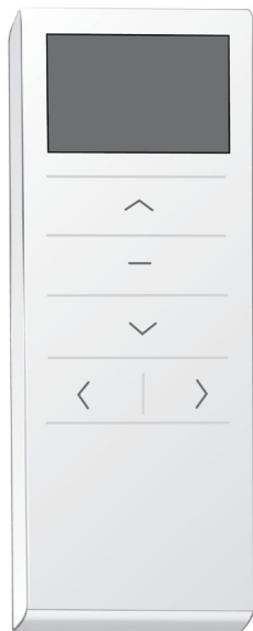
FRONT OF REMOTE