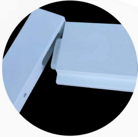
Mortise and Tenon Joinery