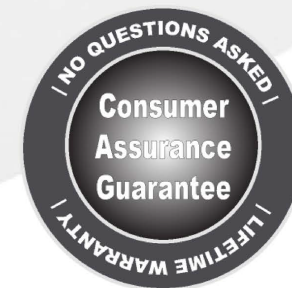
Best Warranty in Business