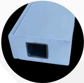
Aluminum Reinforced Stiles