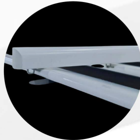
Advanced Staple Technology