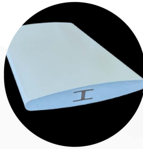
Sturdy Poly Construction